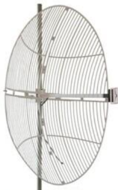
4-piece assemble, fig1

ZDAGP1721-19-15----1710-1880/2110-2170 MHz 19dBi, 2-piece die cast grid antenna, fig1 ZDAGP1721-23-9----1710-1880/2110-2170 MHz 23dBi, 4-piece die cast antenna, fig2