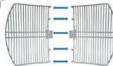
2-piece assemble, fig2