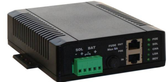
TP-SCPOE Charge Controller