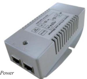
TP-POE-HP High Power