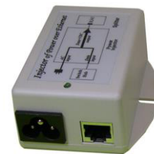
TP-POE Medium Power