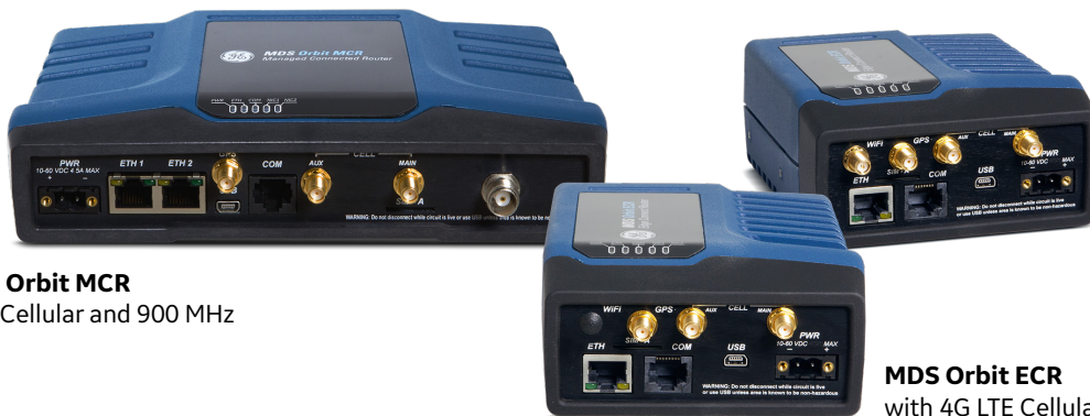
MDS Orbit MCR with Cellular and 900 MHz

A Wi-Fi radio option can be selected as a standalone, or as a secondary radio for licensed, unlicensed or cellular radios. Orbit offers two versions of Wi-Fi to meet performance and cost requirements. A 802.11 b/g/n 2.4 GHz Wi-Fi option supports up to 7 clients/hosts per AP. A 802.11 a/b/g/n 2.4/5 GHz option provides enhanced dual antenna (MIMO) performance and up to 32+ clients per AP.