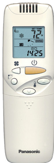
Wireless Remote Height 6-15/16", Width 2-7/16"

Wireless Remote for MT and MD Type Units